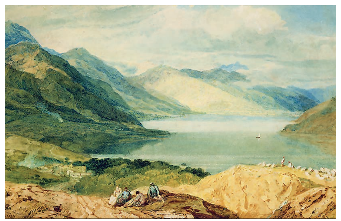
Figure 1: Painting of Loch Lomond, Scotland by W.M. Turner, 1834

Make the fullest possible use of examples and data to support your answers.